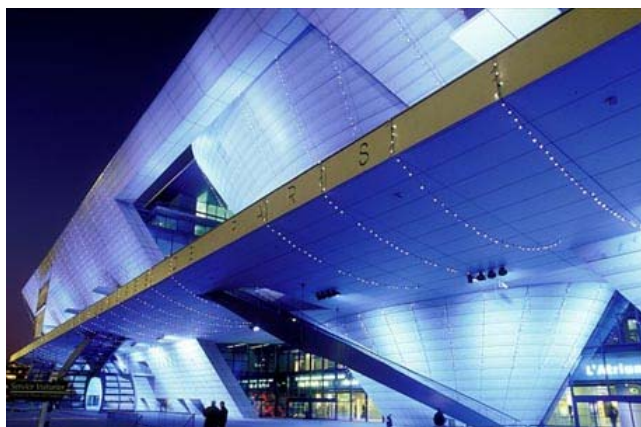
Palais des Congrès de Paris, France

Please send us your comments: elizabeth.podnieks@utoronto.ca