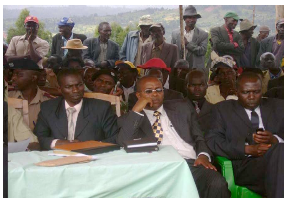
Some of the invited guests during the WEAAD celebrations-Nyansakia Primary School Grounds

The United Nations International Plan of Action adopted by all countries in Madrid, April 2002, clearly recognizes the importance of addressing and preventing abuse and neglect of older adults and puts it in the framework of the Universal Human Rights.