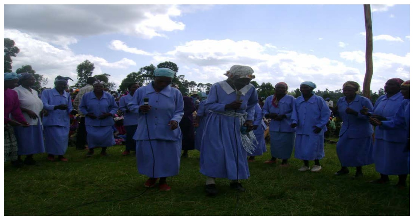
Older women from Matongo Women Group perform a traditional song