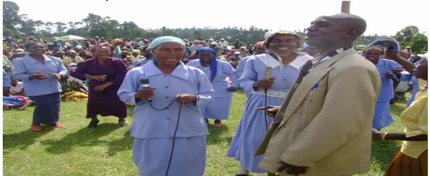
A local leader joins women dancers in a jig to send "abuse way" from the community

HelpAge Kenya underscores the fact that there is need for greater awareness, sensitization and empowerment of older persons and the communities they live in. That elder abuse in Kisii in the form of lynching is what catches the eye; it is only a tip of the iceberg. It underlines great danger and precarious conditions in which older persons exist in Kisii.